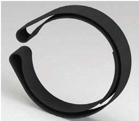
..... Continuous loop

Minimum circumference: 1800 mm (71") when used in continuous loop.